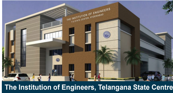
The Institution of Engineers, Telangana State Centre

49 th Indian Valuers Congress and Annual General Meeting of the Institution of Valuers will be held at The Institution of Engineers, Telangana State Centre, 6-2-910, Visvesvaraya Bhawan, Khairatabad, Hyderabad – 500 004 (Telangana) from 28 th to 30 th December 2018.